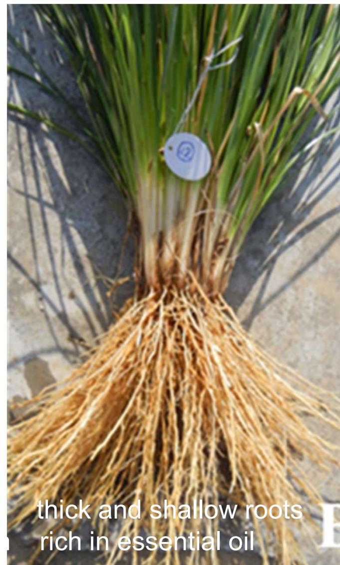
thick and shallow roots rich in essential oil