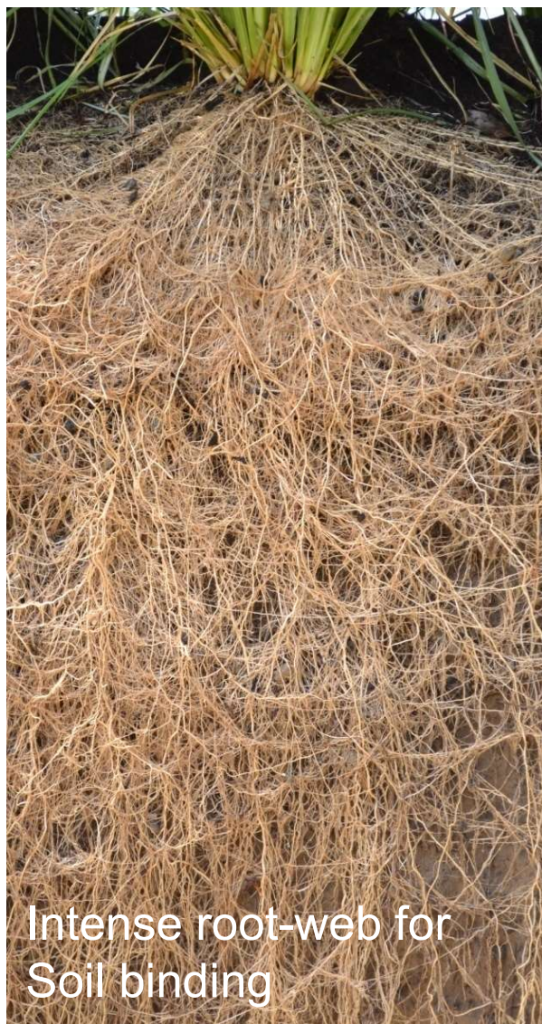
Intense root-web for Soil binding