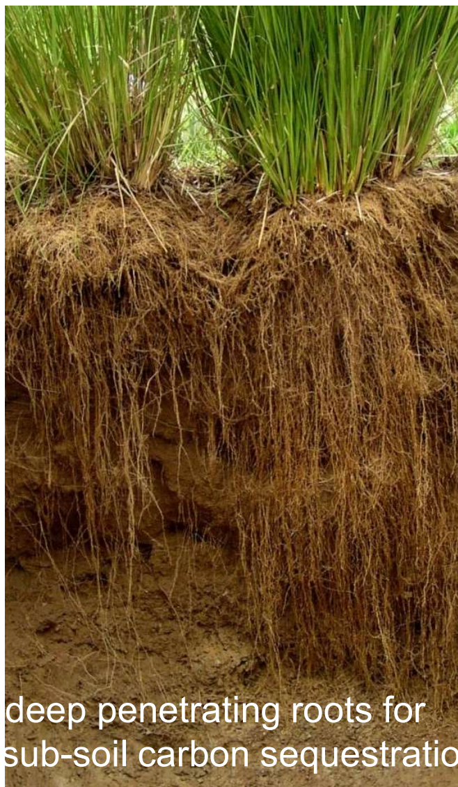
deep penetrating roots for sub-soil carbon sequestration